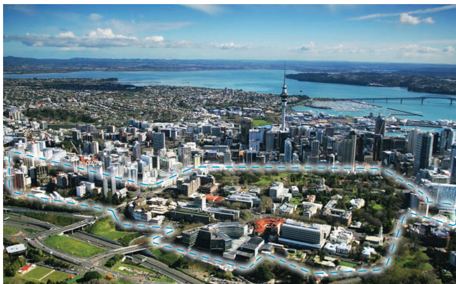
University of Auckland City Campus