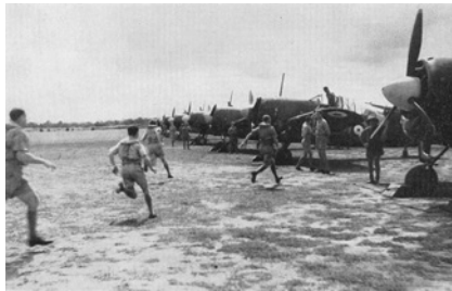
Plate 6. Brewster Buffalo pilots of 488 Squadron scrambling as their planes come under Japanese attack at Kallang Airport, Singapore, late 1941.