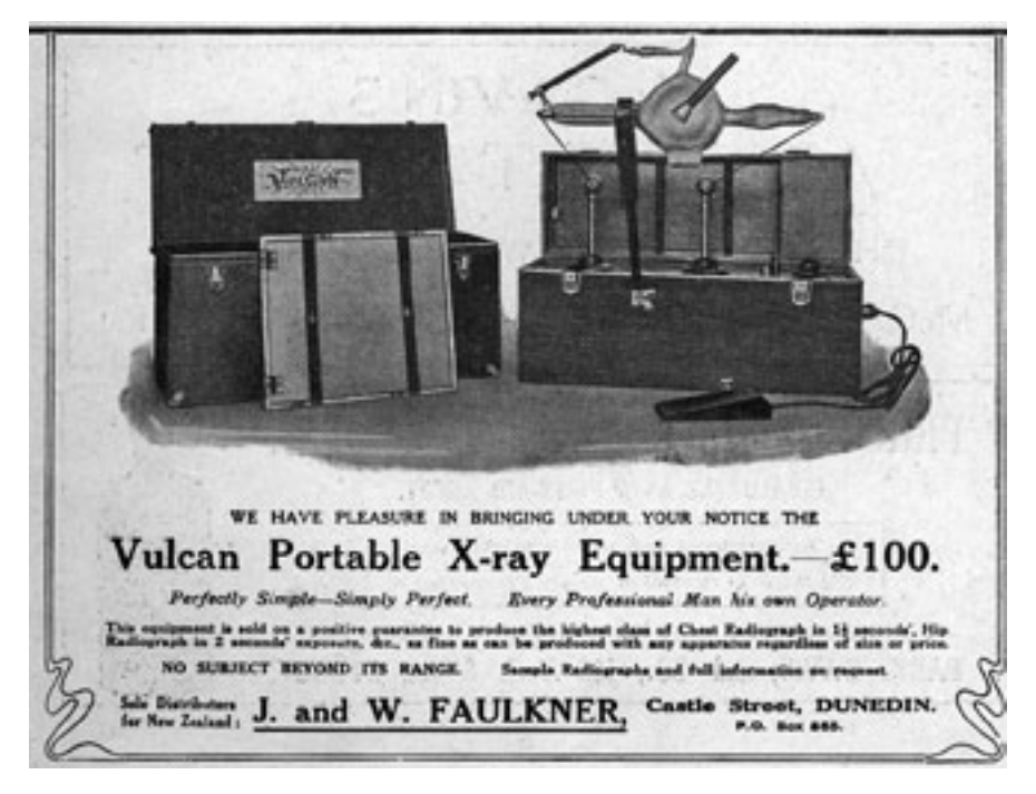
From a handful of x-ray machines at the turn of the century, New Zealand had an estimated 450 x-ray installations by 1944. This advertisement ran in the New Zealand Journal of Health and Hospitals in 1920. H1, box 1816, 53/119, alt 28289, Archives New Zealand, Wellington, New Zealand.

compounds containing barium or iodine, soft tissues such as the digestive and urinary tracts could be examined by x-ray.