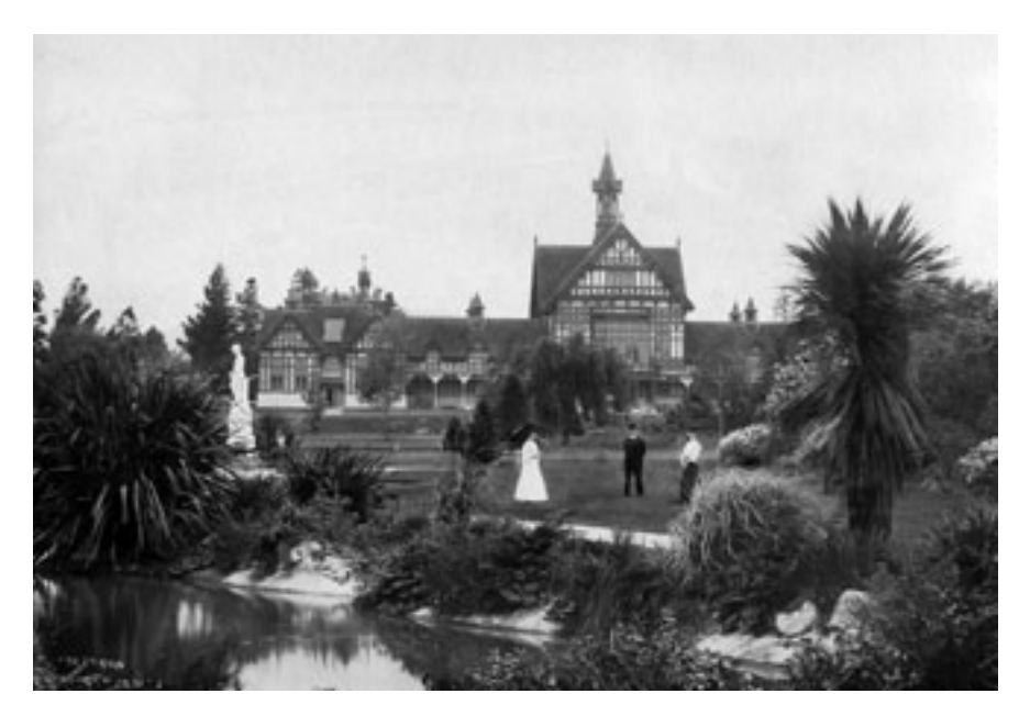
In 1914, the luxurious Rotorua Bathhouse added radioactive water — four to six glasses a day were recommended — to the spa's list of therapeutic treatments. OP-2489, Rotorua Museum of Art and History, Te Whare Taonga o Te Arawa, Rotorua, New Zealand.

had declared that treatment by radioactive waters, with their 'alterative effects on metabolism', had come to stay and its 'possibilities were very great'.<sup>3</sup> Wohlmann described radon water as being able to be provided by injection, by vaginal or rectal douches, or insertion into tooth cavities, but at the Rotorua Bathhouse he focused on administering radon through the skin and lungs, by soaking in steaming hot radioactive baths or inhaling radon gas, and by drinking radioactive water, which he described as 'by far the most satisfactory method of administration' as it stayed in the body much longer.<sup>4</sup>