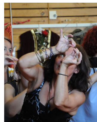
A Creativity in Corrections workshop, organised by Arts Access Aotearoa in partnership with The University of Auckland and Goethe-Institut New Zealand