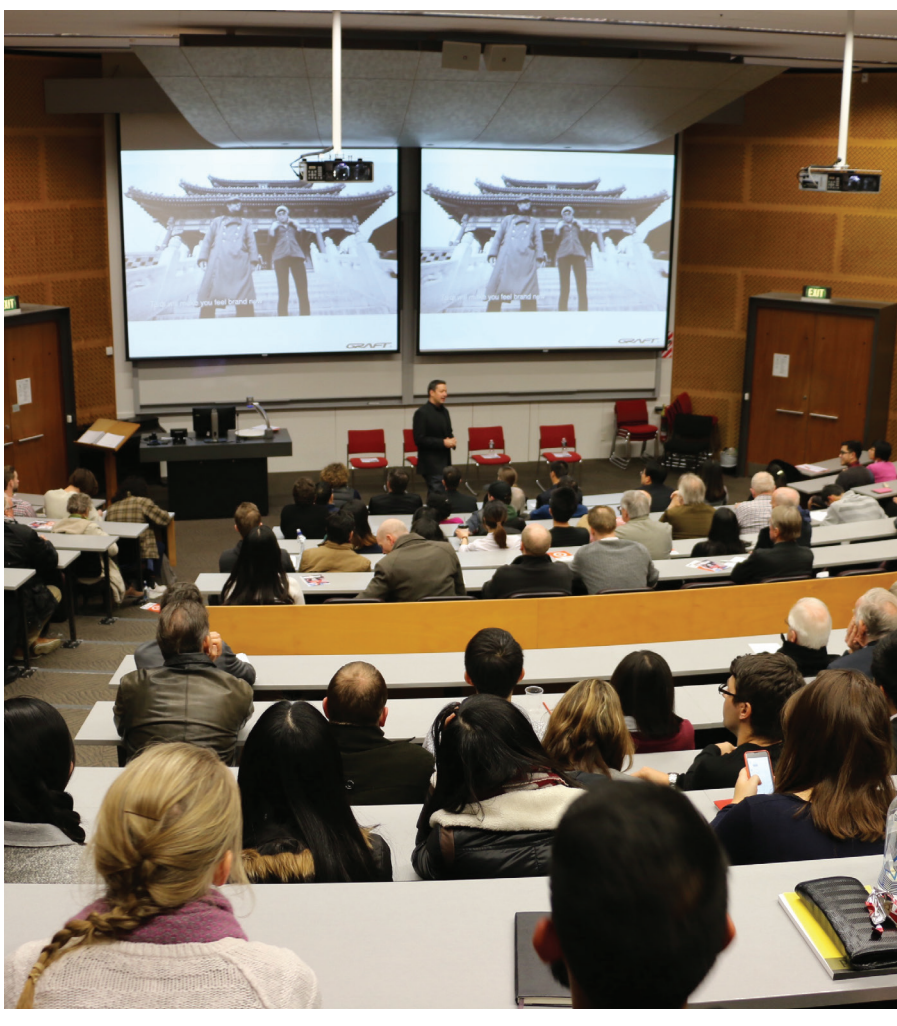
Explore areas of interest through lecture series featuring invited New Zealand and international experts.

We are working with the architecture and planning accreditation bodies to have our combined masters aualifications accredited.