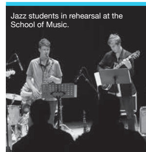
Jazz students in rehearsal at the School of Music.

Sunday 28 August, 5pm Sundays@5 // Ensembles in Concert MT, Free admission / p.5