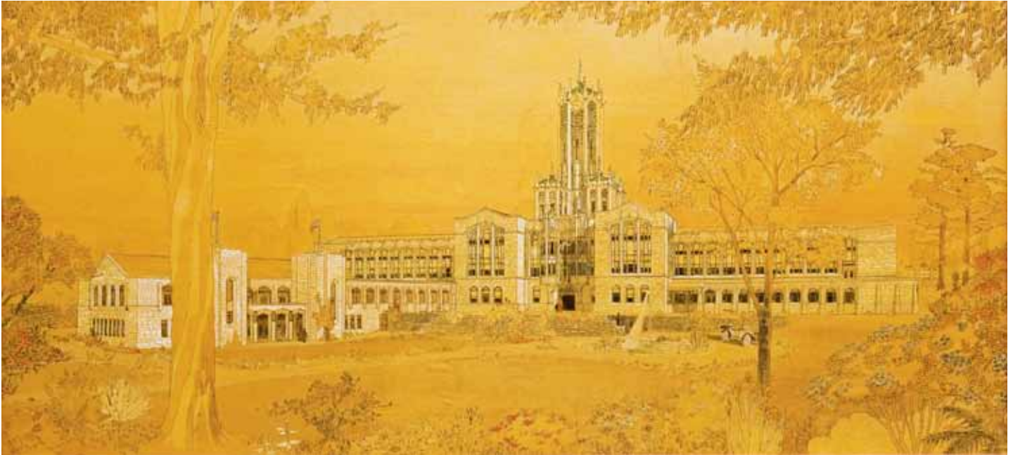
Marion Lucy Mahony Griffin (1871-1961), Perspective View of Arts Building and Student Club from Symonds Street, Auckland College 1920 Pen and wash on silk, 510 x 1100mm, The University of Auckland Art Collection