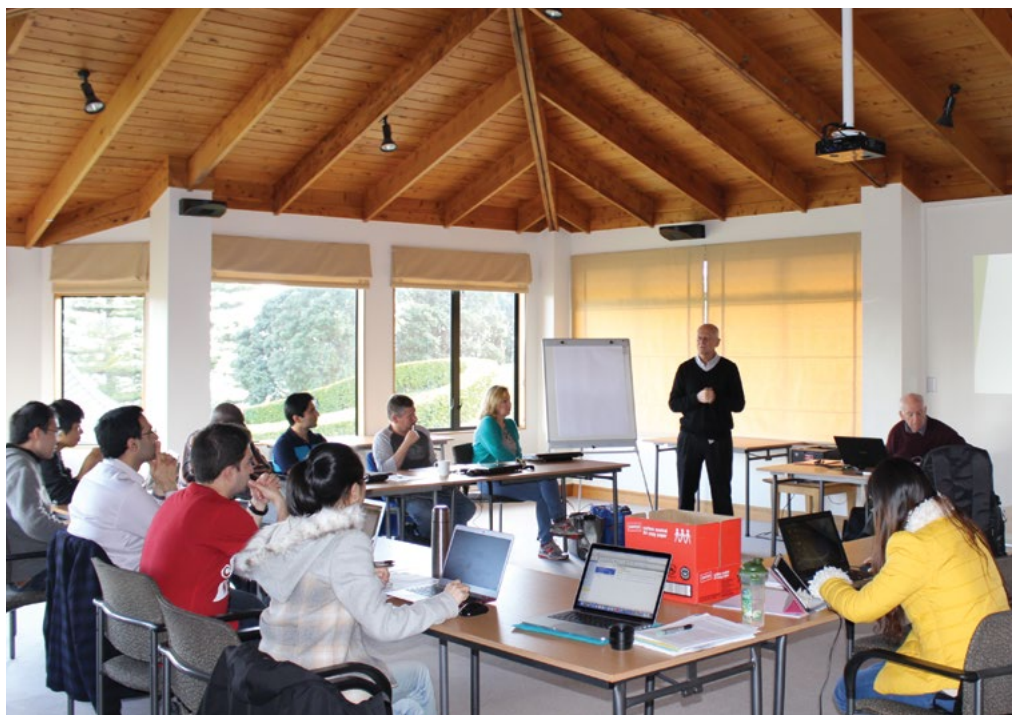
2016 PhD Writing Retreat participants at Vaughan Park Retreat Centre in Long Bay.

The PGSA aims to make postgraduate life on campus more enriching and acts as the political voice to promote students' interests within the University and the community. The PGSA's volunteer board hosts social and academic events, sends out a regular newsletter and acts as a representative on various boards and