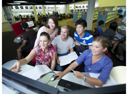
Meeting of great minds from all over the world

We understand that choosing the right university to meet your study abroad needs, hopes and expectations can be a considerable challenge, albeit an exciting one. Catering to more than 1800 exchange students from over 30 countries and 265 institutions in AY2016-2017, we are proud to introduce NTU as your first choice for an Asian study abroad experience.