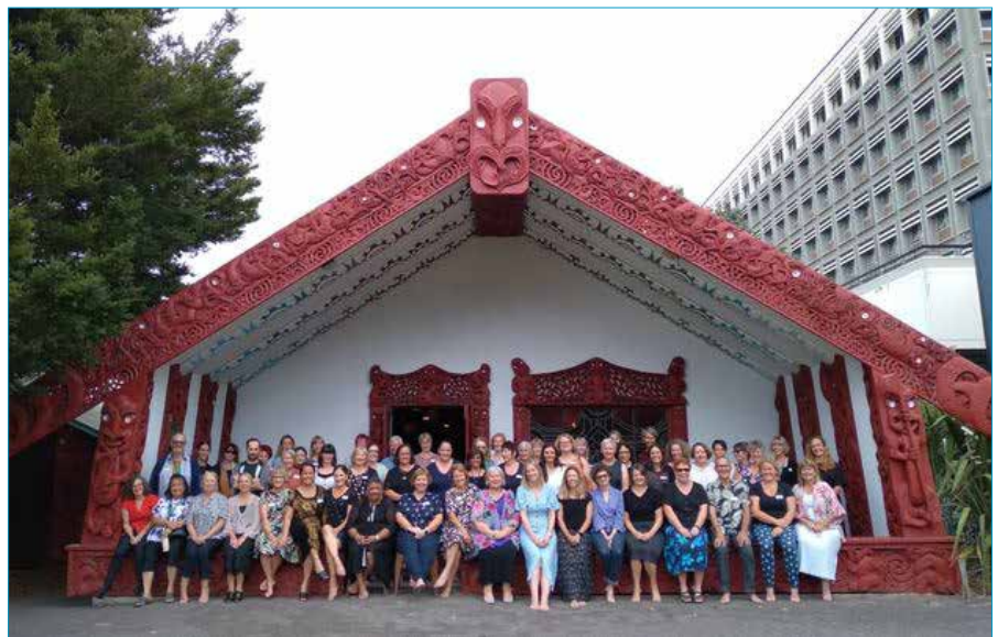
Above: School of Nursing Hui January 2021