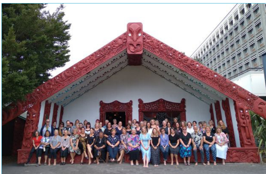
Above: School of Nursing Hui January 2021