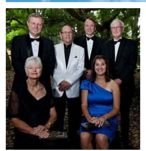
2011 Distinguished Alumni