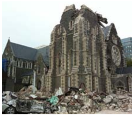
Christchurch Cathedral