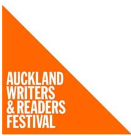
Win two lanyard passes to Writers & Readers Festival events

Readers Festival - granting access to many - in our free draw to all new members