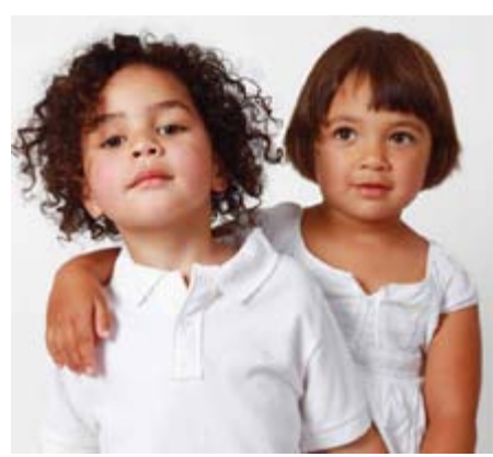
Growing our future - New Zealand's largest longtitudinal study is featured in Auckland Now